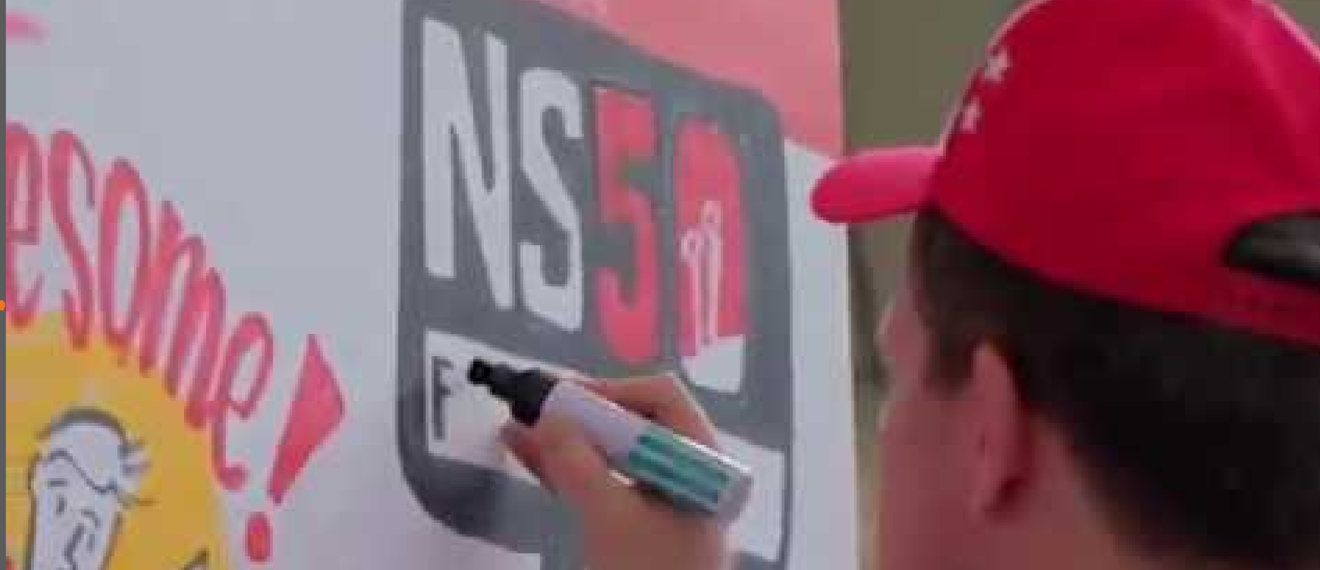
Art of Awakening' at NS50 Sports Festival Posted by Ministry of Defence, Singapore (MINDEF) 1,417 Views