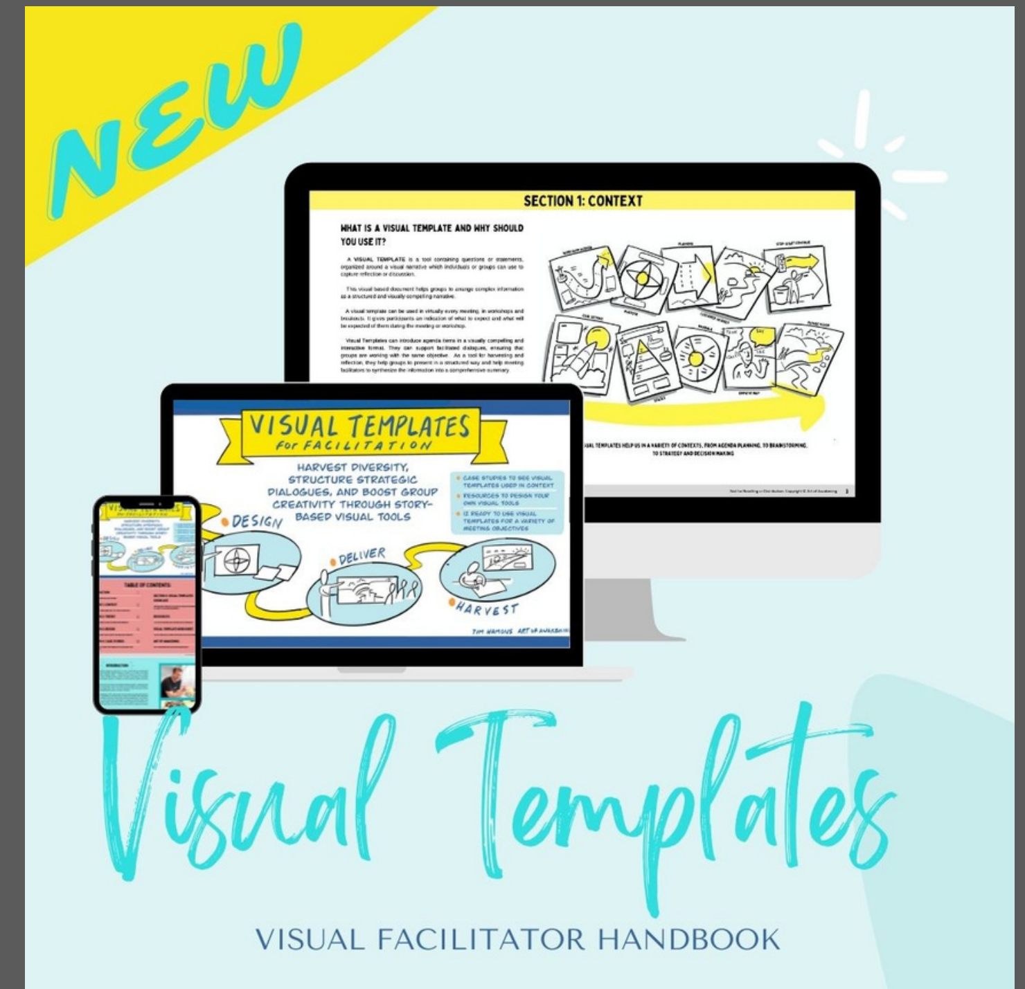
Visual Templates eBOOK, 2020